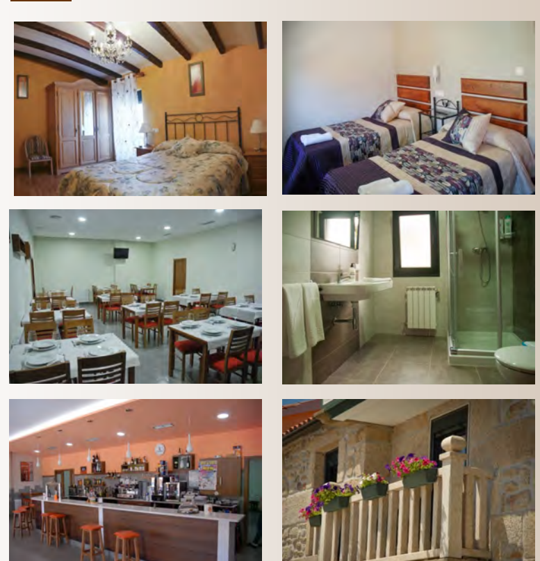
You can book the accommodations in this guide in JUST ONE STEP