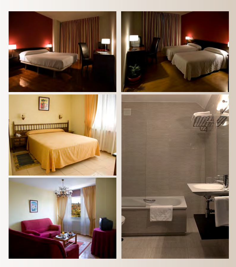
You can book the accommodations in this guide in JUST ONE STEP